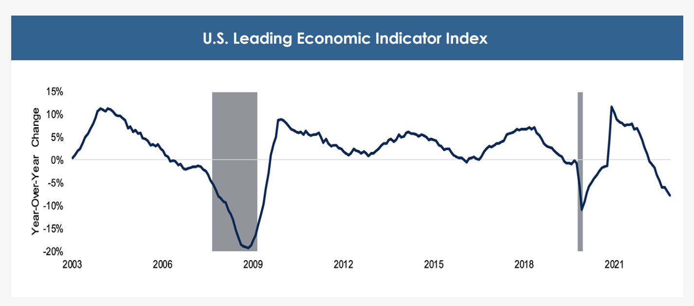
Sources: FactSet, Conference Board, ECRI, As of March 31, 2023, Grey bars indicate recession period.

Lagged indicators, such as Gross Domestic Product (GDP) or employment help measure the past but have little predictive value for the future. Leading Economic Indicators (LEI) by contrast seek to proceed economic change by looking further up the value chain. For example, a potential leading indicator of future home inventory is building permits. Unlike the strength of lagged indicators today, leading indicators have been falling.